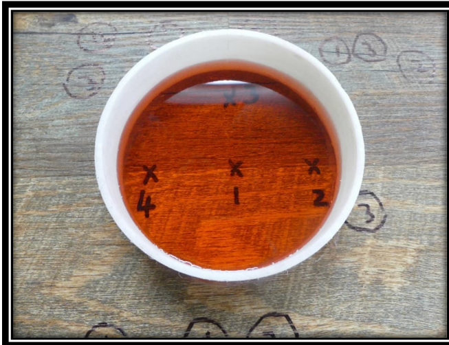
After 24 hrs With Water